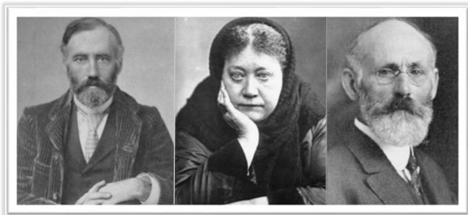
William Q. Judge